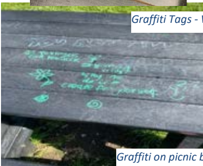
Graffiti on picnic benches at Playing Field