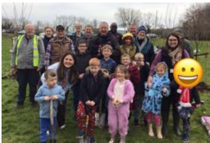
Tree Planting Hero's from Locking Primary School and the Parish Council