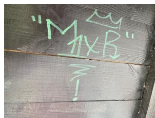
Graffiti Tags - Wooden shelter at Locking Village Park