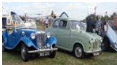
Classic Car Show