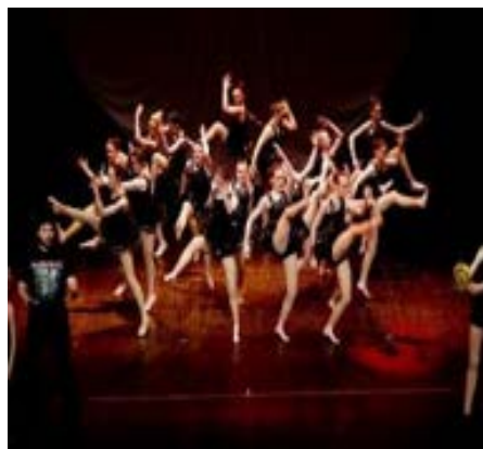
Carlea Theatre Arts

Our next performance will be at the Playhouse Theatre on 11 February 2024