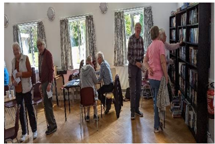
Community Living Room, Tea & Tech Session and the Book Exchange at the Parish Hall

We are pleased to see that Locking Book Exchange is being well used. As well as books for all ages, we have jigsaws and DVD's. This is a free service, open to everyone, there is no registration or fee. Just bring a book and exchange for one or two you want to read. An easy, fun way to swap books you no longer need.