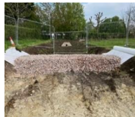
Work commences on the Drainage Swale