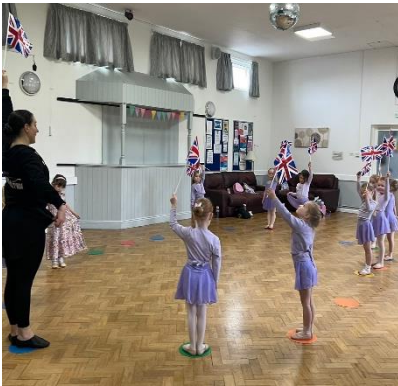
Carlea Theatre Arts

Our current timetable at Locking Parish Hall is as follows: -