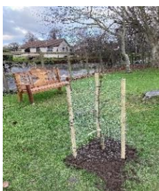
Jubilee Bench & Tree