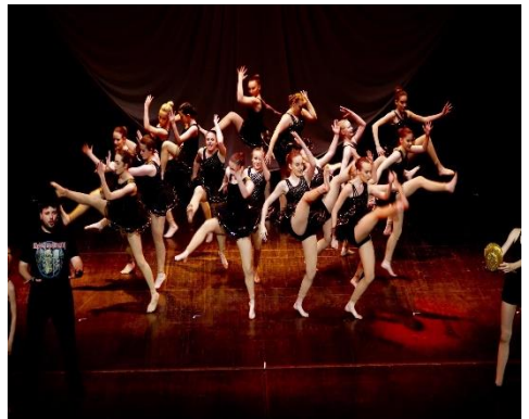
Carlea Theatre Arts

Full timetables of all classes are on our website: www.carleatheatrearts.co.uk