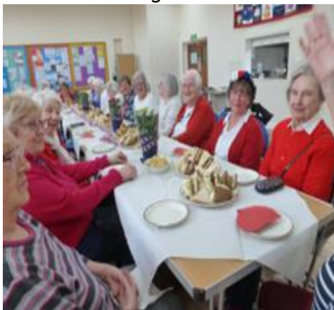
Locking Senior Club

On May 3 rd , we held an Afternoon Tea in celebration of the forth coming Coronation of King Charles.