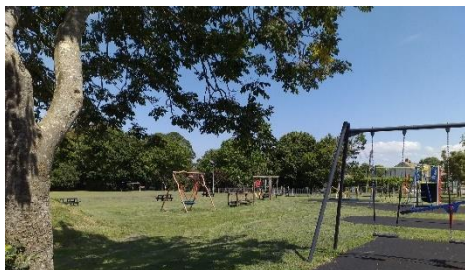
Figure 1The Park

RoSPA will be conducting their annual inspection of all play equipment in June. We will be installing another wheelchair inclusive picnic table in the very near future.