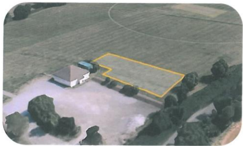
Current proposed location: Old Banwell Road Playing Field.

Locking has amazing play equipment that caters for young families, but is there really anything for youth and older people? What did you do when you were 15 years old? What do your children/grandchildren get up to? We want to ensure an all-inclusive facility to provide a designated area for all ages and abilities; while also encouraging a healthy, active lifestyle away from screens!