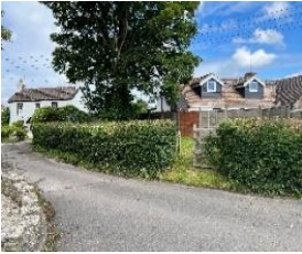
Figure 2 The Green

This is a small area of green opposite the Coronation Garden – It's surrounded by hedging with a small access gate – lovely space if you want to 'Get away from all' to sit, read or picnic.