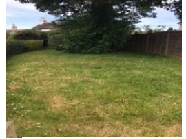
Figure 3 The Green

This is a small area of green opposite the Coronation Garden – It's surrounded by hedging with a small access gate – lovely space if you want to 'Get away from all' to sit, read or picnic.