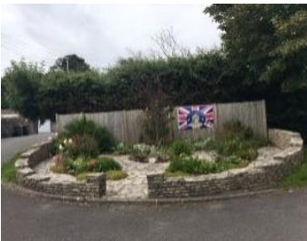
Figure 4 Coronation Garden