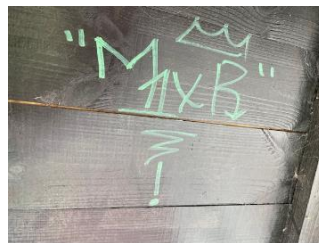
Graffiti Tags - Wooden shelter at Locking Village Park